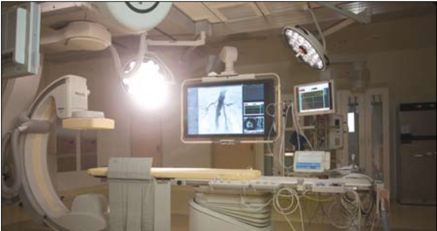
TOP: Alaska Native Medical Center’s Surgical Services staff works in the hospital’s new hybrid operating room. ANMC is Alaska’s only Level II Trauma Center and the new hybrid OR strengthens those services for trauma patients from around Alaska. ABOVE: A view of some of the state-of-the-art technology available for specialists who work in the Alaska Native Medical Center hospital’s new hybrid operating room.