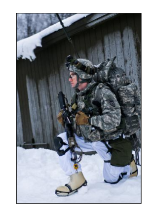
COURAGE READY (JPARC, AK)

Emergency Readiness Deployment Exercises hosted by America's First Corps (I Corps) as part of the Army's readiness model