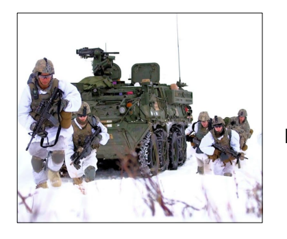
ARCTIC EDGE (MAR 18, Alaska) Biennial Homeland Defense Exercise hosted by ALCOM under