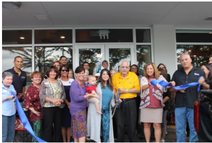
Ribbon Cutting for Besties Boutique featuring Lularoe