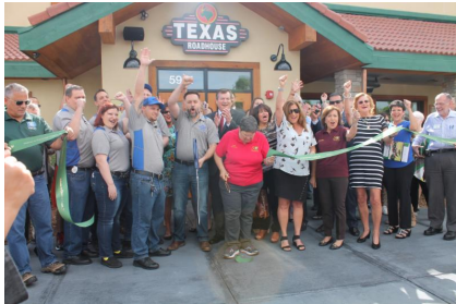
Ribbon Cutting/Grand Re-Opening at Texas Roadhouse