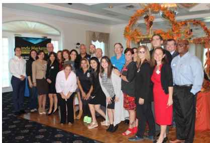
Sponsors of the Shop Small Wake Up Breakfast