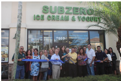
Ribbon Cutting at SubZero Nitrogen Ice Cream