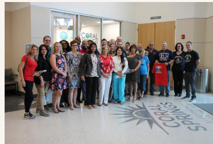
Education Committee Meeting