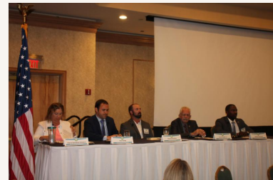
Candidate Forum Wake Up Breakfast Sponsored By Joe DiMaggio Children's Hospital