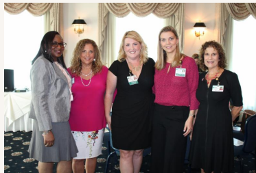
Professional Women's Alliance Luncheon Sponsored By Baptist Health