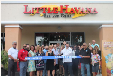
Ribbon Cutting at Little Havana Bar & Grill