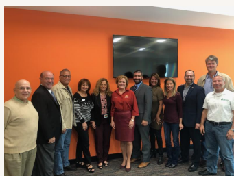
Government Affairs Meeting