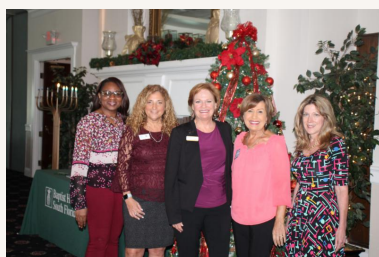
Professional Women's Alliance Luncheon