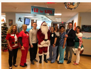
Annual Toy Drive benefiting Broward Health Coral Springs and Family Central