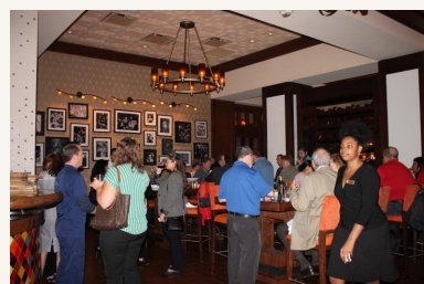
Holiday After Hours Networking Event at Sorrisi -