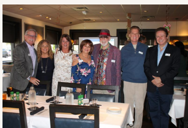
Trustee Luncheon with NEXTgen at Bonefish Grill