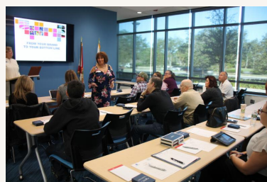
Biz Academy Sponsored by The City of Coral Springs Economic Development Office & Florida Power and Light