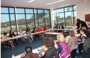
Chamber For Good Business Breakfast Sponsored by Blue Stream