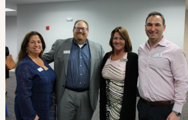
Trustee Luncheon and Bus Tour through Corporate Park