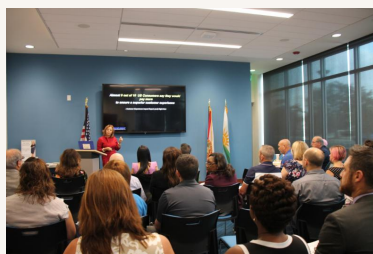
Biz Academy Sponsored by The City of Coral Springs Economic Development Office & Florida Power and Light