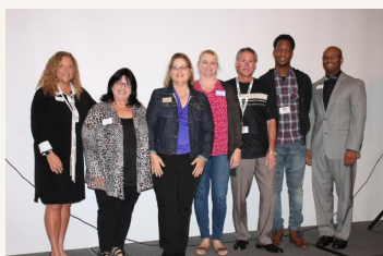
New Members of the Chamber being recognized at the January Wake Up Breakfast Sponsored by the City of Coral Springs