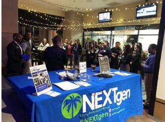
NEXTgen Net @ Nite at American Craft Kitchen