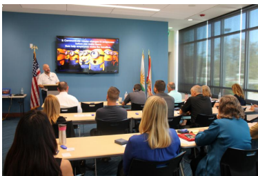
Biz Academy Sponsored by The City of Coral Springs Economic Development Office & Florida Power and Light