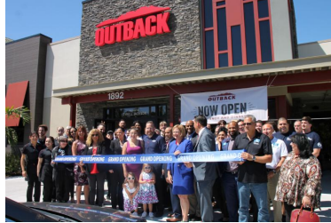
Ribbon Cutting for Outback Steakhouse