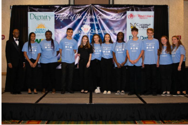
Night Of The Stars Grand Gala Student Volunteers From Monarch High School