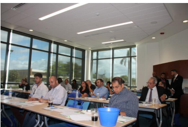
Check Out The Chamber - New Member Orientation Sponsored by First Data