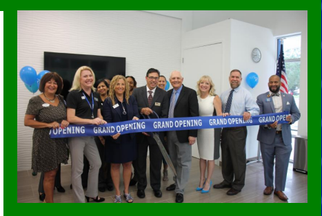
Ribbon Cutting at Tropical Financial Credit Union