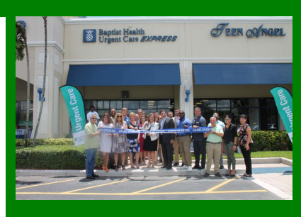
Baptist Health Urgent Care Express Ribbon Cutting