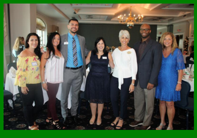
Professional Women's Alliance Luncheon