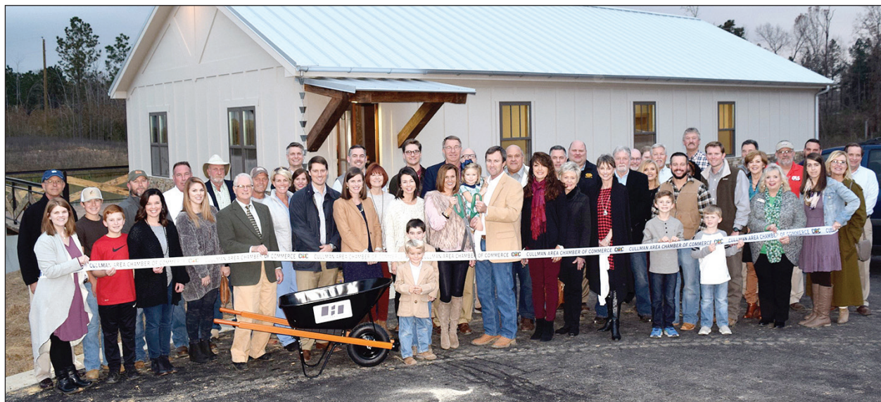
C H Harris, Inc. | 413 County Road 1339, Cullman, AL 35058 | 256-595-4973