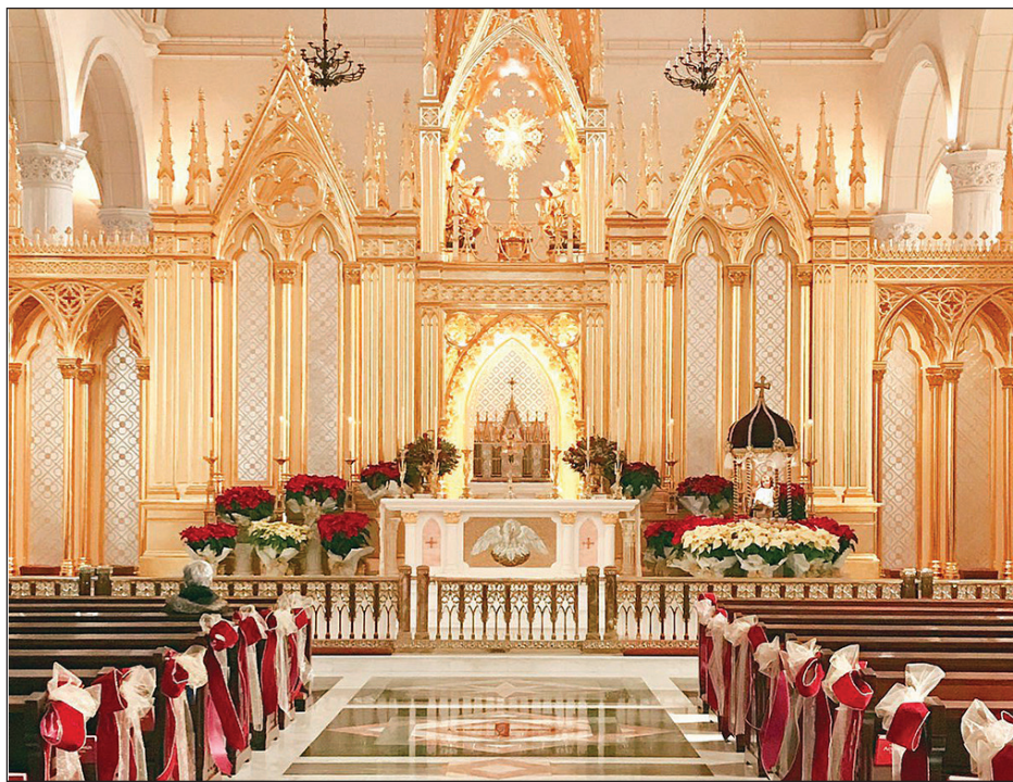
SHRINE OF THE MOST BLESSED SACRAMENT

Whether it's the unique architecture of St. Paul's Lutheran Church, the history represented by St. John's Evangelical Protestant Church, or the iconic and highly visible steeples at Sacred