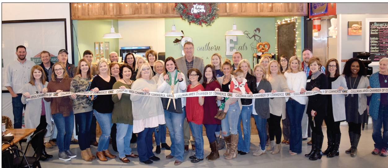
Southern Eats Cafe | 110 1st Ave. NE, Cullman, AL 35055 (inside Mae's Food Hall) | 256-727-4282