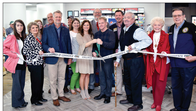
dale's - West Point | 275 County Road 1242, Vinemont, AL 35179 | 256-735-4440