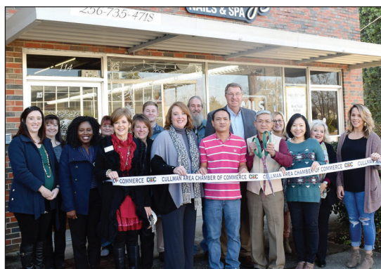
Holly's Nails & Spa | 114 2nd St. SE, Cullman, AL 35055 | 256-735-4718