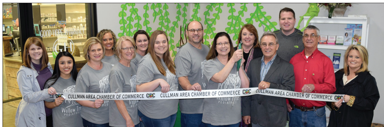
Willow Tree Pediatrics | 1167 County Road 437, Cullman, AL 35055 (connected to Good Hope Pharmacy) | 256-735-4632