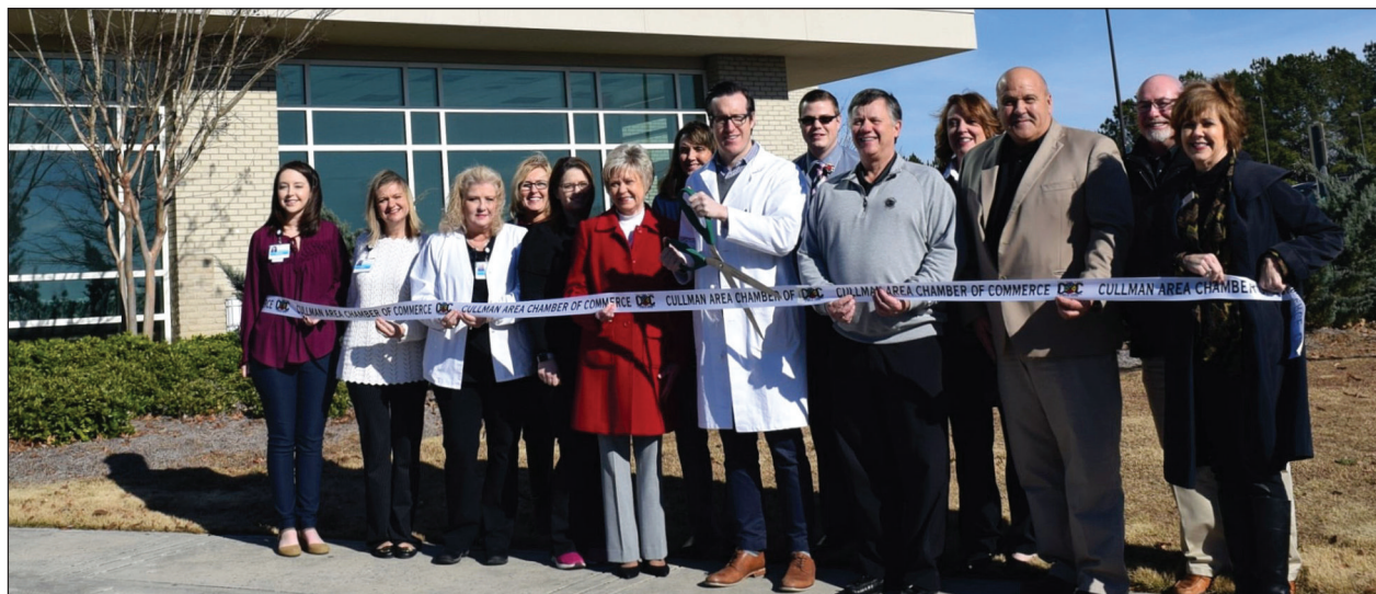
Cullman Regional Urology Clinic | 1800 AL Highway 157, Professional Office Building 3, Suite 201, Cullman, AL 35058 | 256-737-2177