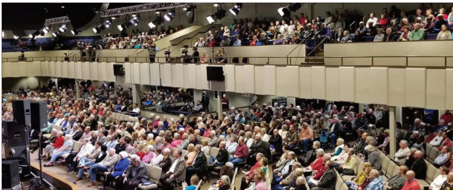
CULLMAN AREA CHAMBER OF COMMERCE &amp; VISITOR CENTER

With everyone on the team hoping for a moderate turnout, the event opened its doors on January 18 at Temple Baptist Church. Based on the number of vehicles already in the parking lot, it didn't take long to realize something special was fixing to happen.