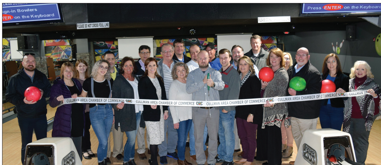
Cullman Bowling Center | 1710 Tally Ho St., Cullman, AL 35055 | 256-734-2600