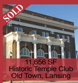
11,656 SF Historic Temple Club Old Town, Lansing Redevelopment Dave Robinson