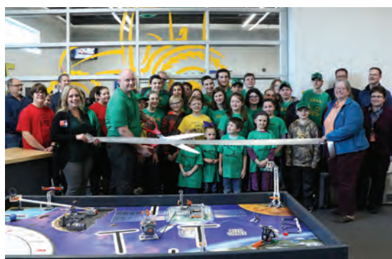
The group poses before cutting the ribbon.

Origami Brain Injury Rehabilitation Center welcomed a crowd of over 200 people for their annual An Evening of Reflections event on March 14. This inspirational event provides brain injury survivors and caregivers a platform to share their recovery journeys. This year's theme was the process of returning to life after brain injury through hard work, determination, patience, and the support of those we love.