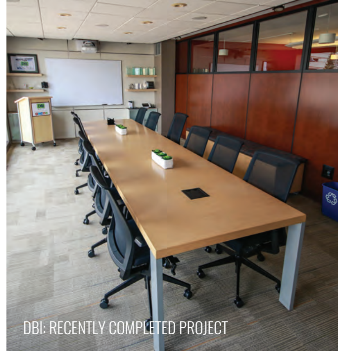
DBI: RECENTLY COMPLETED PROJECT

in reputation. Every DBI member feels they are part of something special in bringing the best products and services to our customers.”