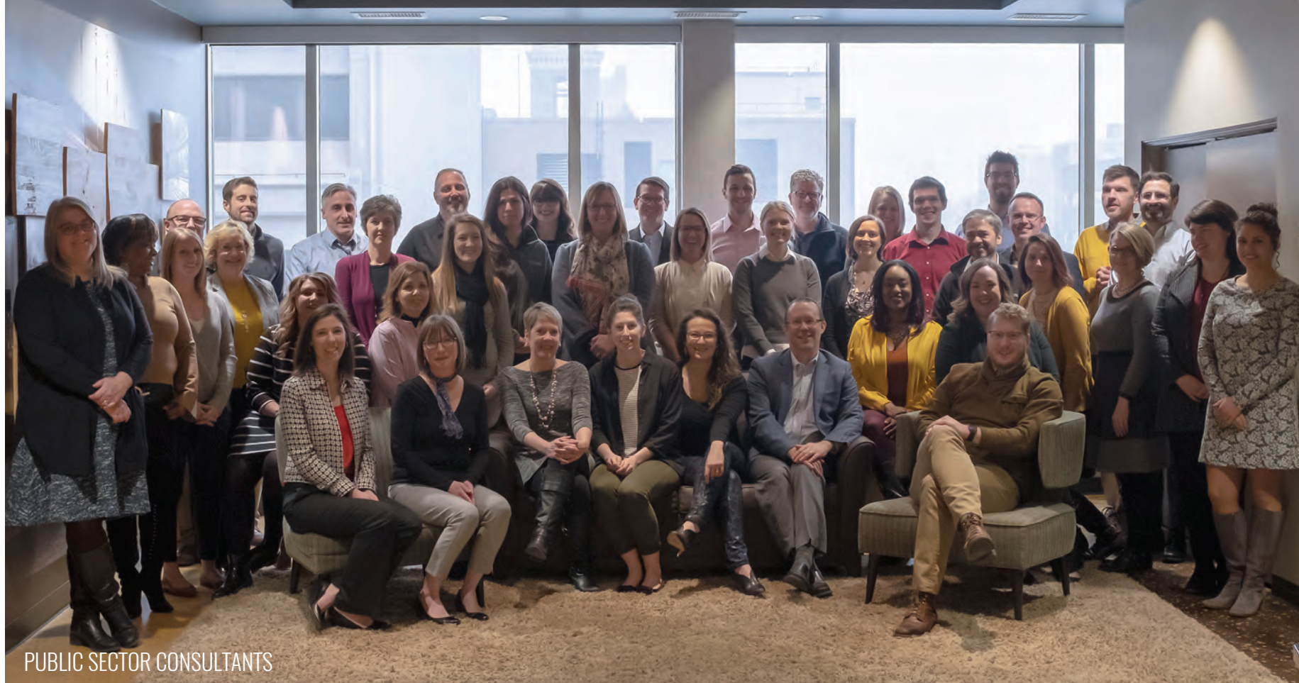
PUBLIC SECTOR CONSULTANTS

provide high quality therapy TODAY to everyday people with everyday problems.”