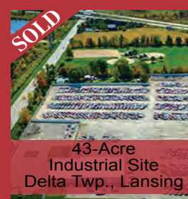
43-Acre Industrial Site Delta Twp., Lansing Auto Salvage & Auction Nick Vlahakis

OFFICE | RETAIL | INDUSTRIAL | LAND | INVESTMENT PROPERTIES | DEVELOPMENT