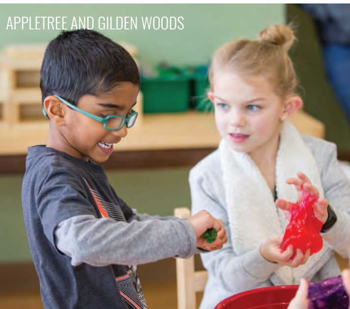
APPLETREE AND GILDEN WOODS

AppleTree and Gilden Woods has been providing child care and early childhood education for over 20 years. It's no surprise, that this company was awarded the 50 Companies To Watch, by Michigan Celebrates Small Business.