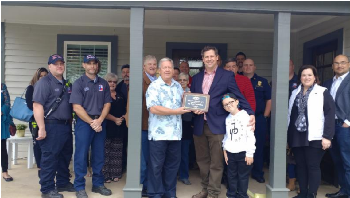
Fig Tree Counseling