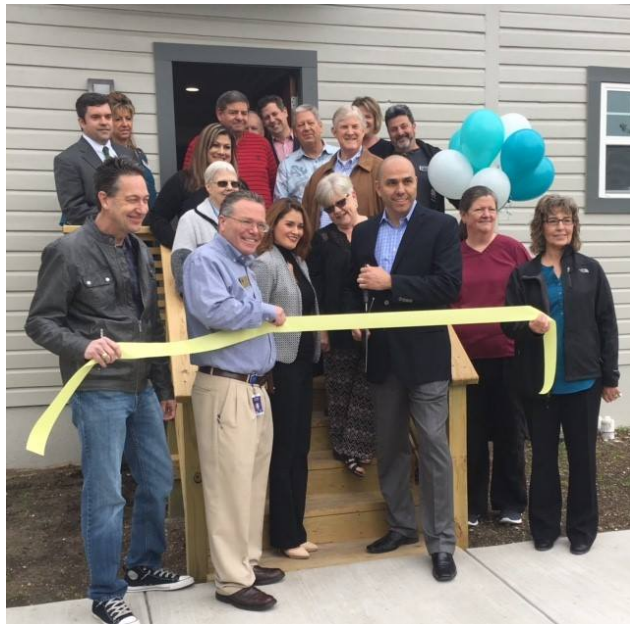
Southwest Funding-The Statewide Group.