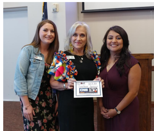
Sponsor: Citizens National Bank of Texas