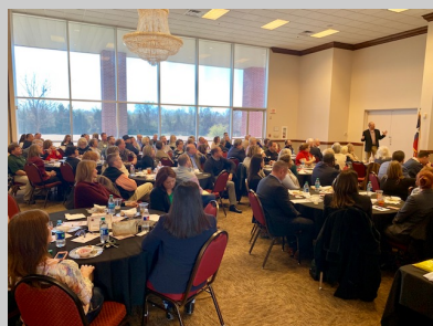
Our busiest Luncheon of the year!