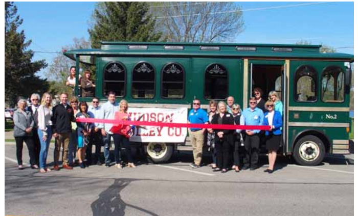
Hudson Trolley Company