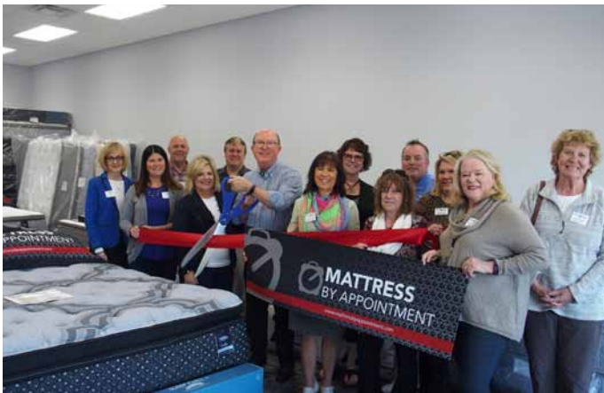
Mattress by Appointment