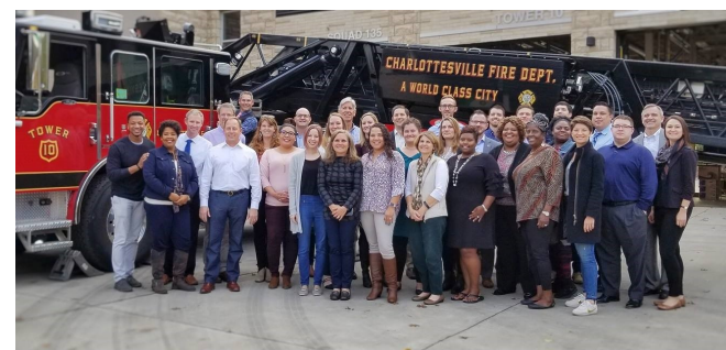
Leadership Charlottesville Class of 2019

Helping Greater Charlottesville build an active corps of dedicated and civically- engaged leaders.