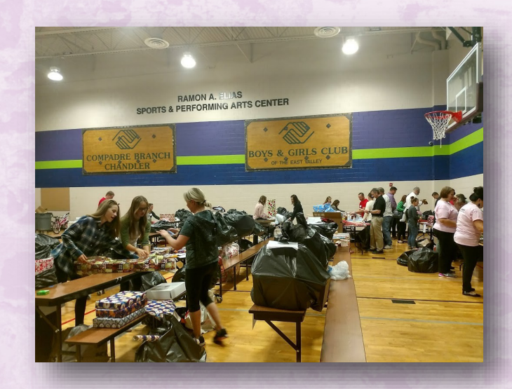
YES @Boys & Girls Club