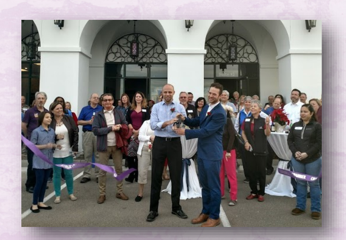
Keystone Law Firm