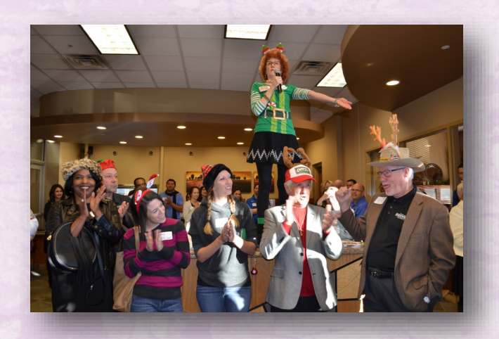
Wake Up Chandler mixer at Landings Credit Union