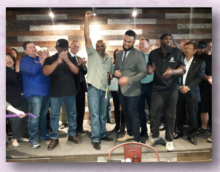
West Alley BBQ