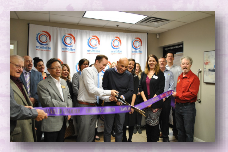
Revitalize Weight Loss & Wellness