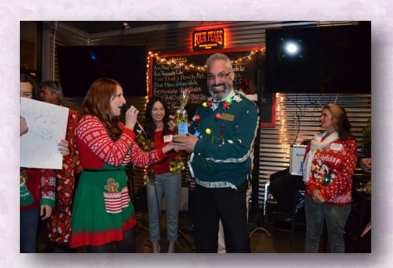
Business After Business at Dirty Blonde Tavern