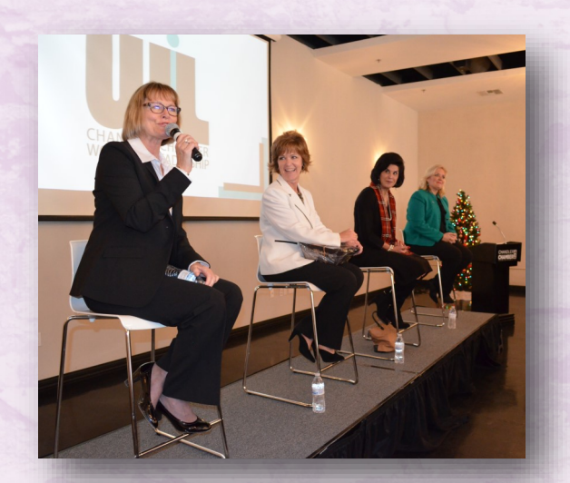
Women in Leadership Super C-Level Panel