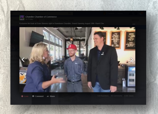
Even Stevens Sandwiches Video