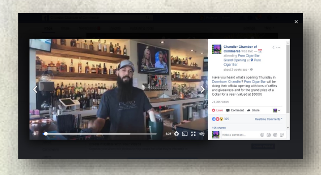
Puro Cigar Bar