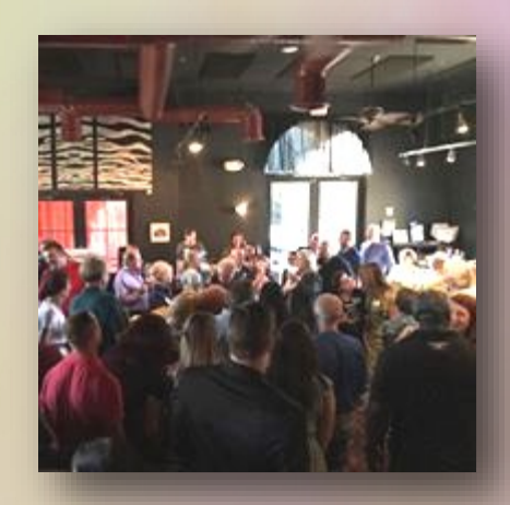
Wake Up Chandler @ Holiday Inn Chandler