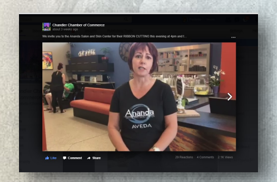
Ananda Salon and Skin Center