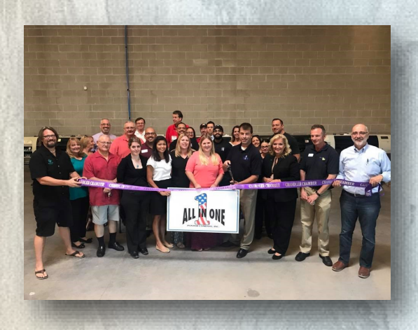
All in One Poster Company Inc