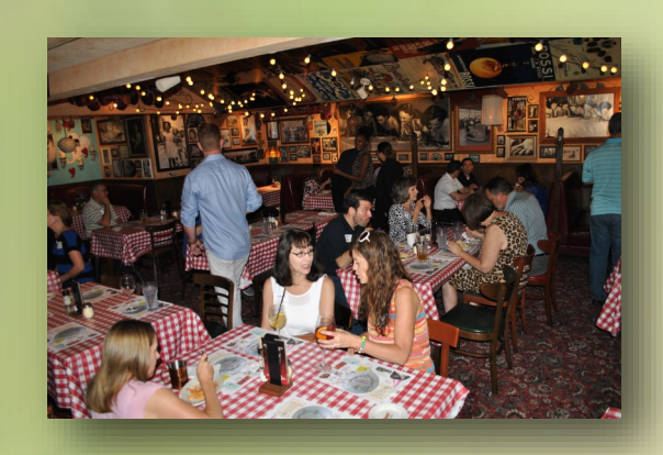
Business After Business @ Buca di Beppo