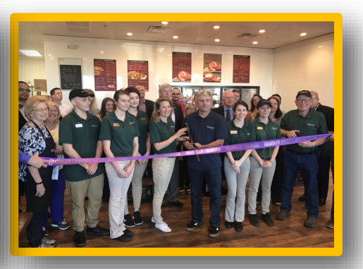
Honey Baked Ham 2975 E Ocotillo Rd #3 Chandler, AZ 85044