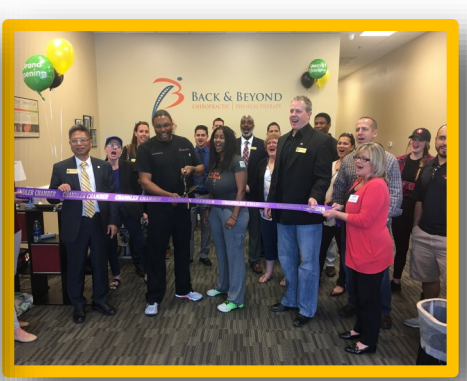
Back and Beyond 1655 W. Chandler Blvd. Ste. 4 Chandler, AZ 85225