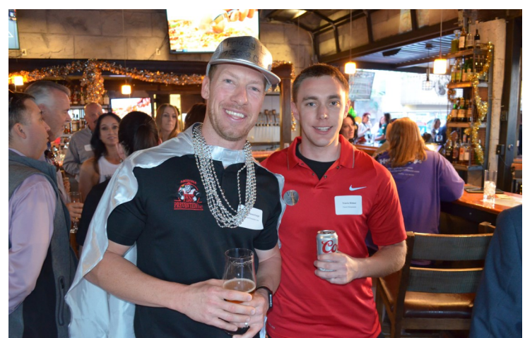
The Chandler Chamber hosted the EVCCA Mayor's Breakfast. Thank you to our breakfast sponsor, WingSpan