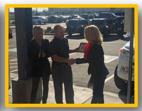
Club Pilates Chandler 4085 S Gilbert Rd, Shops B, Suite 5 Chandler, AZ 85249