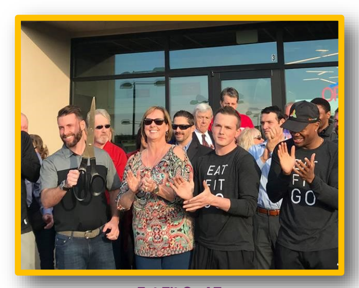
Eat Fit Go AZ 4100 S Alma School Rd, Ste B Chandler, AZ 85248