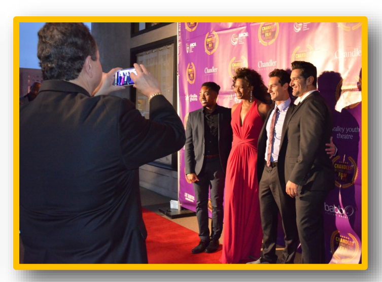
Chandler International Film Festival Held at Soho 63