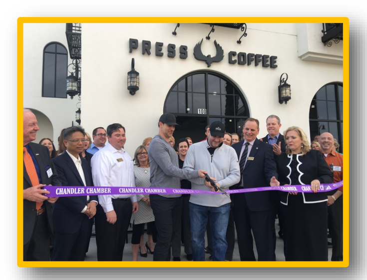
Press Coffee 2577 W Queen Creek Rd Chandler, AZ 85248