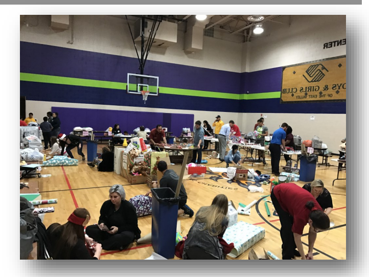
Wake Up Chandler cont.

Young Executives giving back at Boys & Girls Club Compadre Branch