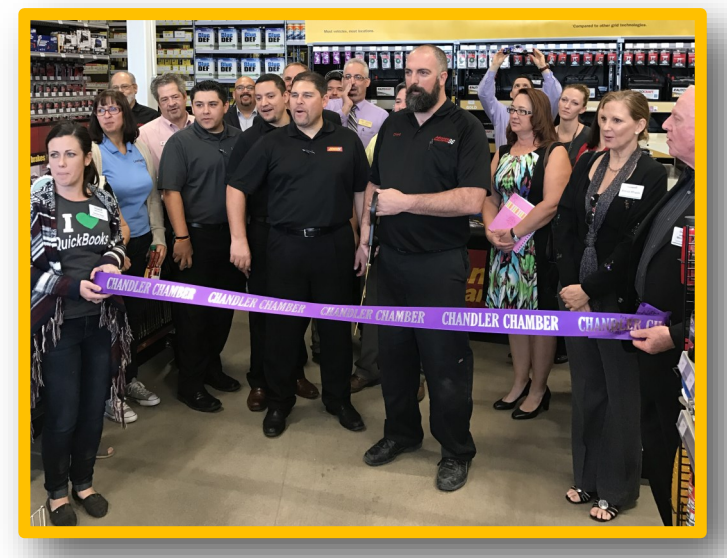
Advanced Auto Parts 6170 W Chandler Blvd. Chandler, AZ 85226