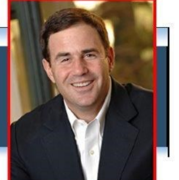
The Honorable Doug Ducey