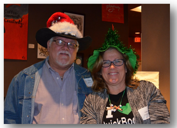
Women in Business