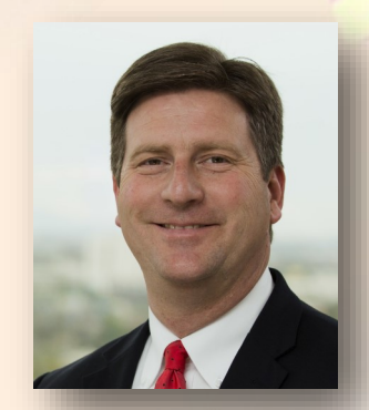
Congressional District 9 U.S. Representative Greg Stanton (D)