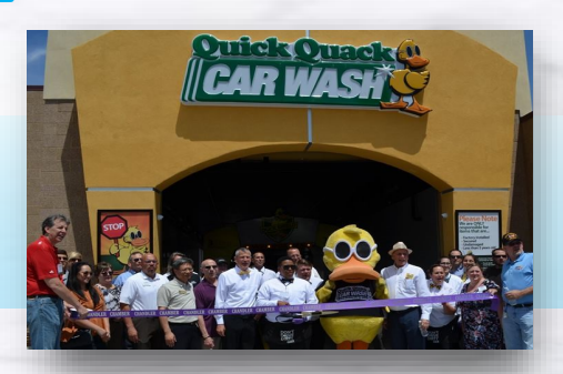
Quick Quack Car Wash + VIP Event 7455 W Chandler Blvd Chandler, AZ 85226 website