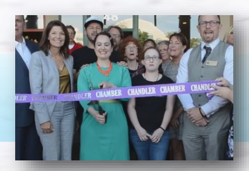
Mingle + Graze 48 S San Marcos Pl Chandler, AZ 85225 website