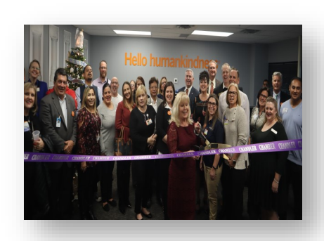
Dignity Health at Home 1351 N. Alma School Rd. Chandler, AZ 85224 website