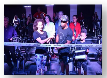
FLO Yoga & Cycle 71 E Frye Rd Chandler AZ 85225 website