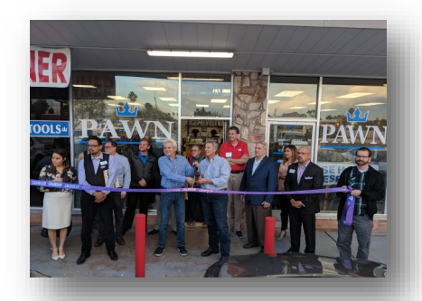
Chandler Pawn & Jewelry 792 N Arizona Ave Chandler, AZ 85225 website