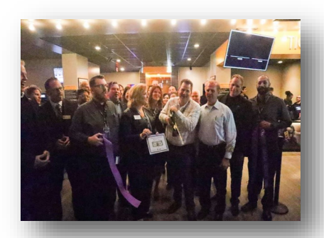
Flix Brewhouse 1 W Chandler Blvd Chandler, AZ 85225