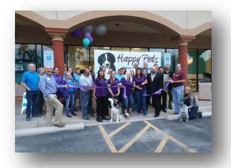
Happy Pets Palace & Playground 1080 E. Pecos Rd, Ste 15 Chandler, AZ 85225