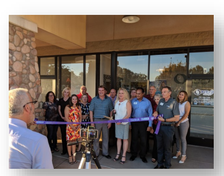
FitLife Med Spa 990 E Riggs Rd #3 Chandler, AZ 85249 website