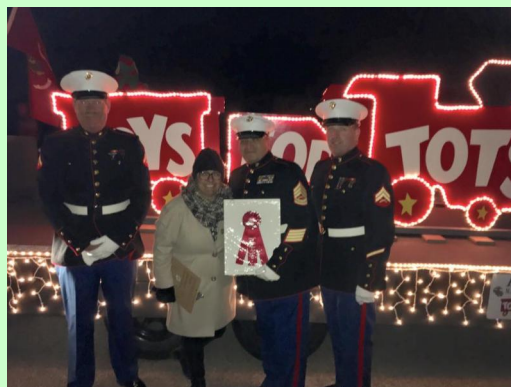
Toys for Tots Best Themed Float

St. Luke Lutheran Best Spirit of the Season Float