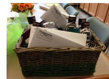
Last year's basket.

Invoices were sent out the 1st week of November. If you have returned your invoice we would like to thank you! If your invoice is paid by December 31, your business will be entered into a drawing for a special prize! Please let me know if you did not receive your invoice and I will get to to you ASAP! Thanks for your attention to this!