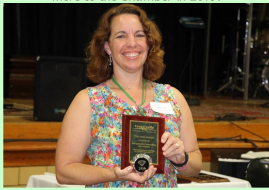
Coopersville Area Community Foundation

Gem Award Winners Thank You... to those businesses and organizations that have contributed $1000 or more to the Chamber in 2016.