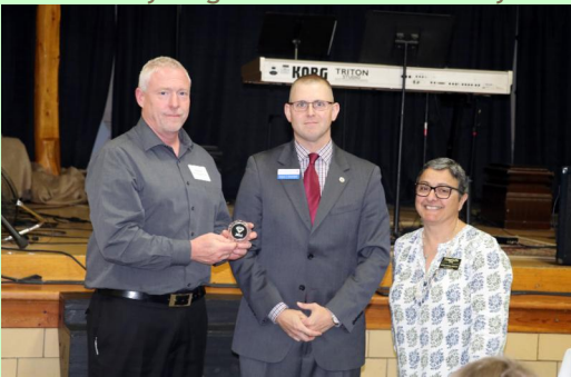
Betten Baker Chevrolet Buick

Awarded to an area Retailer who exemplifies extraordinary customer relations, community relations, and employee relations while providing a variety of goods to the community.