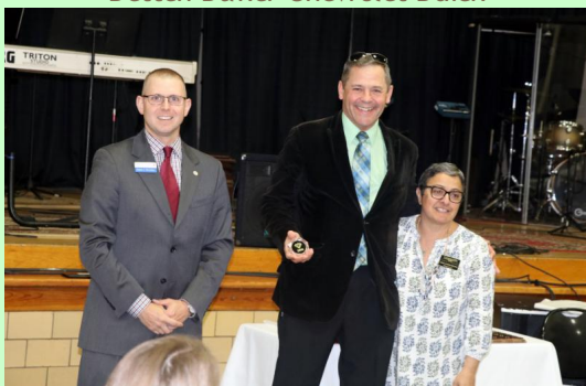
Marketing Management Aggressive Tool and Die