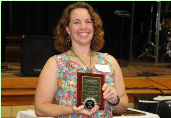
Coopersville Area Community Foundation

Thank You... to those businesses and organizations that have contributed $1000 or more to the Chamber in 2016.