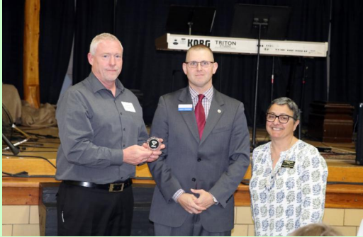
Betten Baker Chevrolet Buick