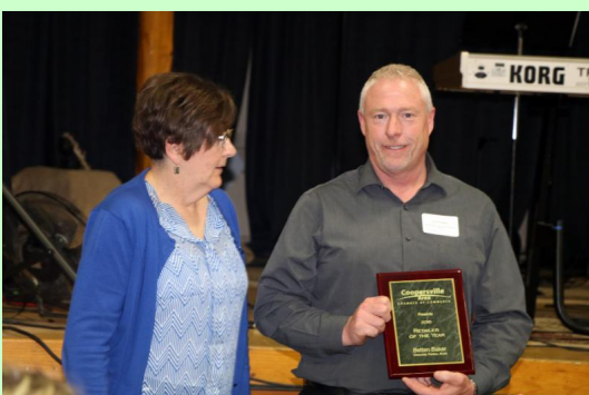
Betten Baker Chevrolet Buick