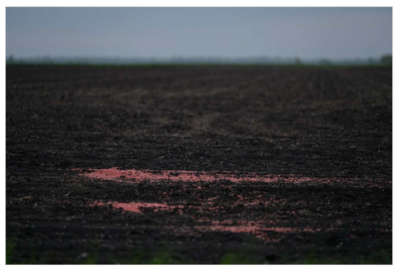
Spilled seed on the edge of a field near the Tympanuchus Wildlife Management Area outside Crookston, Minn., in May.

· In May: As the seed treatment market grows, so do pesticide concerns (https://www.mprnews.org/story/2017/05/10/as-seed-treatment-market-grows-so-do-pesticide-concerns)