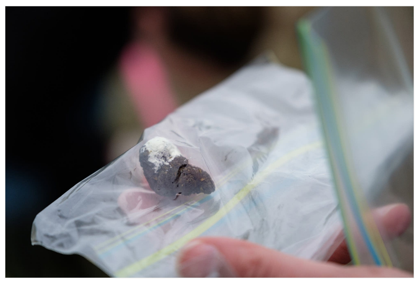
Charlotte Roy holds a bagged pellet sample.

In a statement, Syngenta said, "Neonicotinoids are an essential crop protection tool for farmers and, when used according to the label, safe for the environment." The company added that it works to "educate farmers on the proper stewardship of treated seed to minimize the risk of exposure to non-target organisms, like pollinators, birds and other wildlife. Tags on Syngenta treated-seed bags direct users to "cover or collect treated seeds spilled during loading" to prevent or minimize exposure to wildlife."