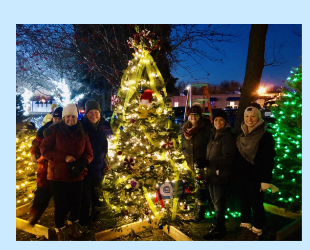
Great River Spine & Sport