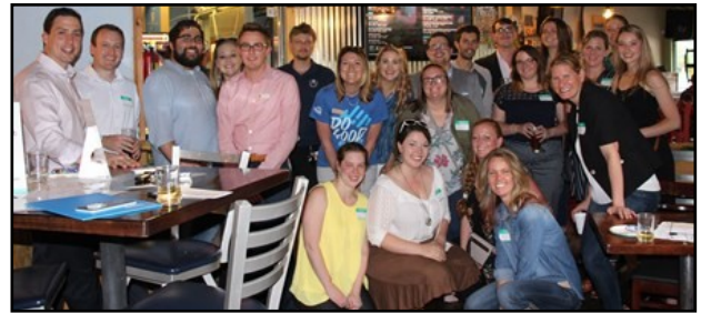
E3YP Young Professionals Mixer