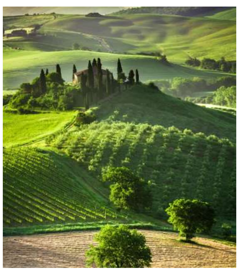
8 Days ● 10 Meals: 6 Breakfasts, 4 Dinners

HIGHLIGHTS... Tuscan Estate, Florence, Choice on Tour, Siena, Tuscan Winery, Lucca, Pisa, Italian Riviera, Cinque Terre, Portofino