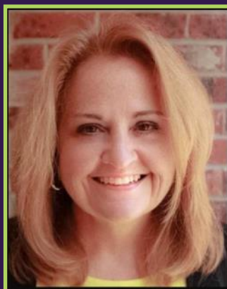
KRISTIN WITT Evergreen Newspapers