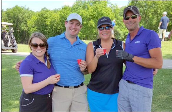
The Golf Tournament encourages a laid-back way to develop relationships with potential clients and vendors.