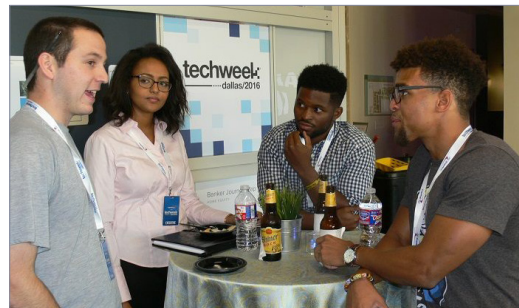
The Tech Titans Innovation team was a sponsor during the Tech Week, here pictured at the Capital One Garage.