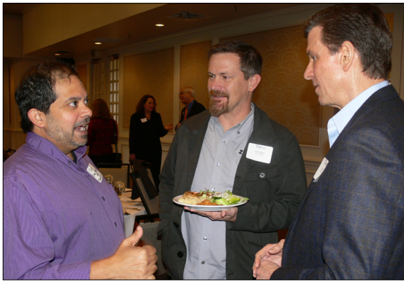
In-depth conversations can happen over a meal at the Tech Industry Lunch, where tech pros build their networks.