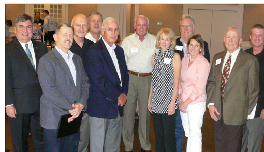
The Tech Industry Luncheon celebrated 20 years of inspiring the North Texas tech community by honoring the first Third Friday Lunch committee.