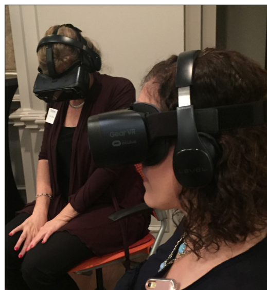
A virtual reality presentation means that the audience gets some hands-on experience from BigLook360.