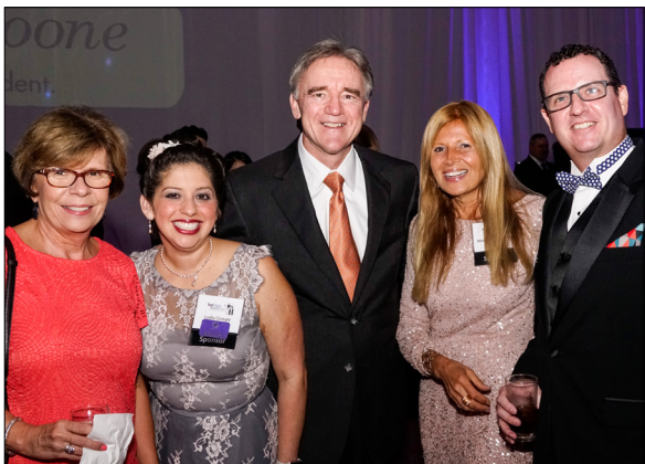
Below: a group enjoys the reception at the Awards Gala.