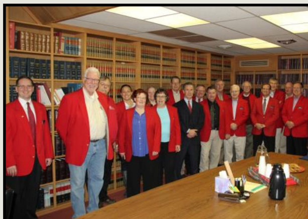
DORAN LAW FIRM