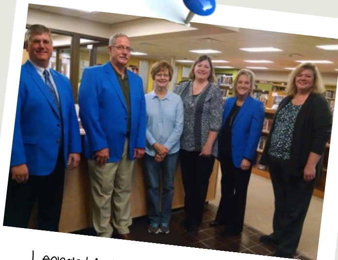
Leonard A. Good Community Library November 16, 2017