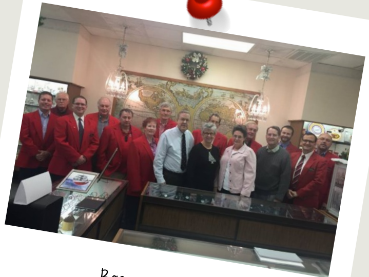
Bacon Jewelers November 28, 2017

Thank you to Walgreens 1-Hour Photo for the donation of pictures for Ambassadors.