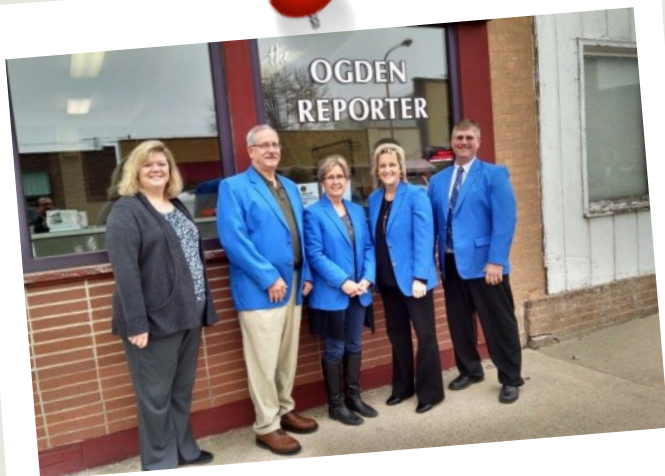
Ogden Reporter November 16, 2017