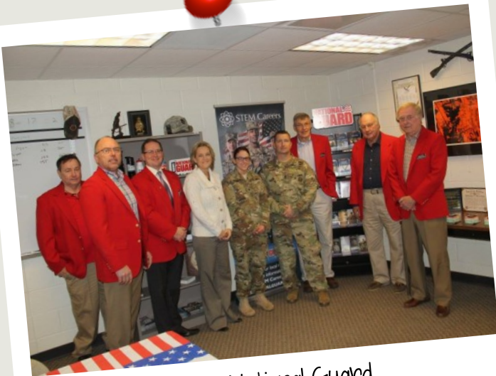
Iowa National Guard November 21, 2017