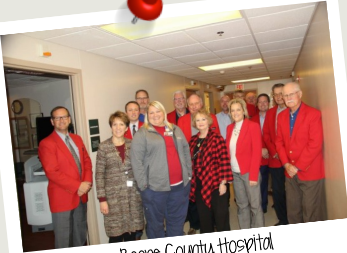
Boone County Hospital November 7, 2017