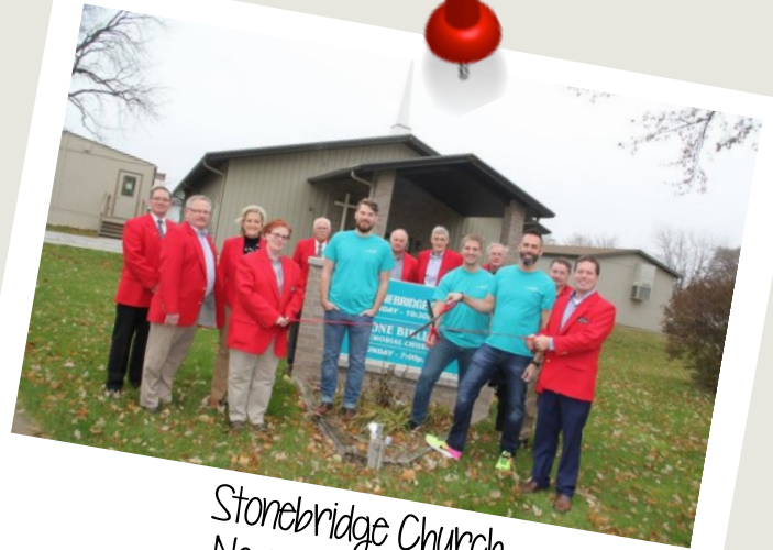
Stonebridge Church November 14, 2017