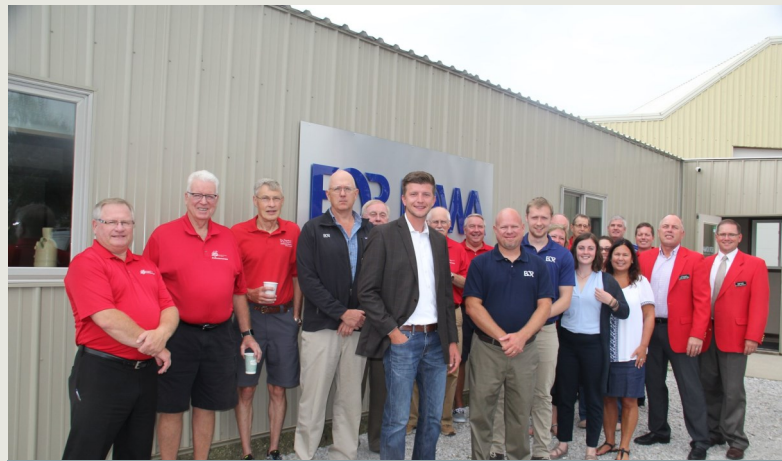
EOR Iowa LLC · August 28, 2018