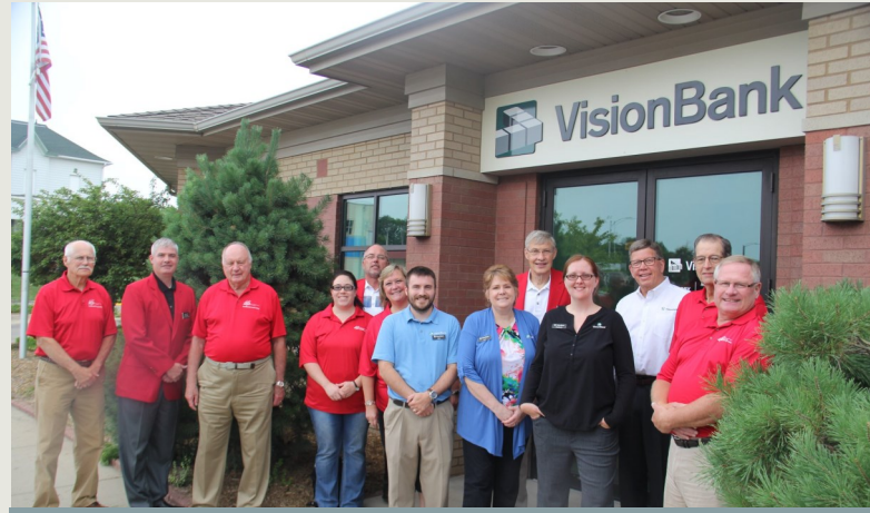
VisionBank · August 14, 2018