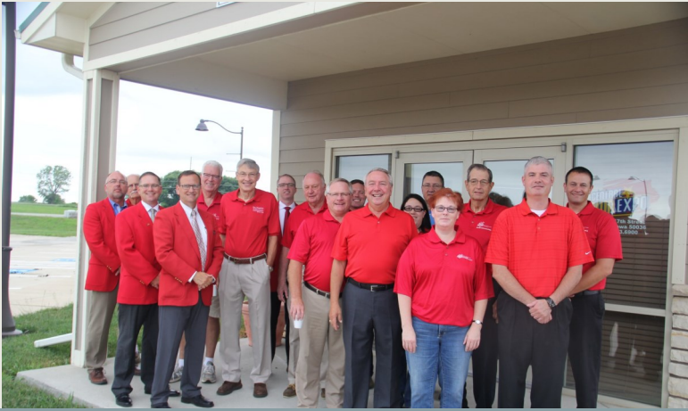
Central Iowa Expo · August 7, 2018