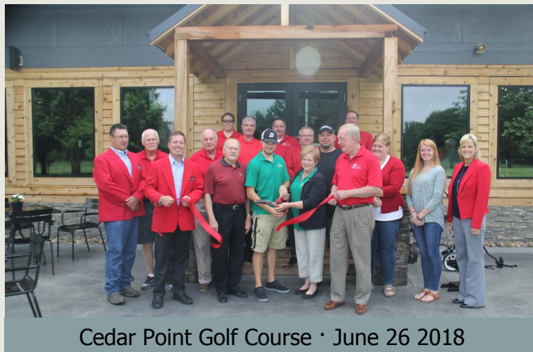
Cedar Point Golf Course · June 26 2018