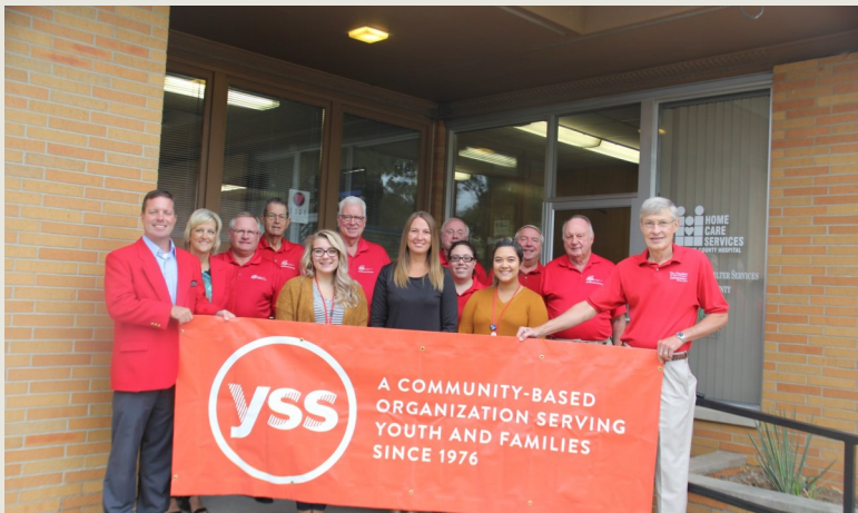
YSS · August 21, 2018