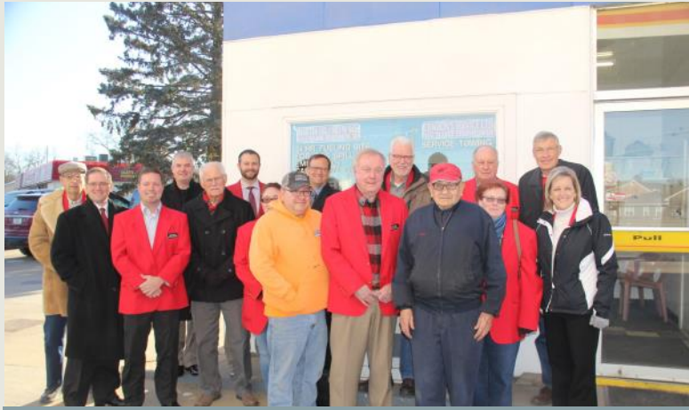
Condon Services • November 27, 2018