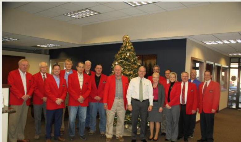
Boone Bank & Trust • December 18, 2018