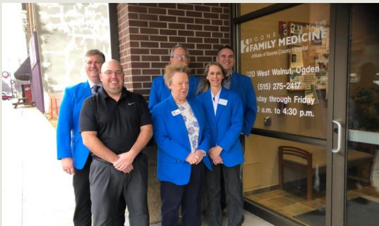
Boone County Family Medicine • December 20, 2018