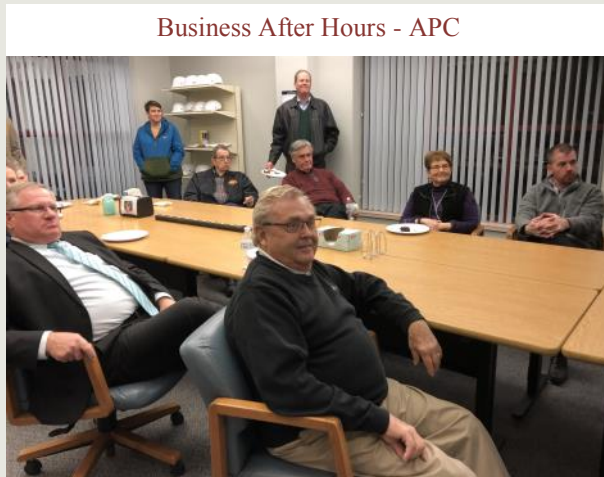
Business After Hours - APC