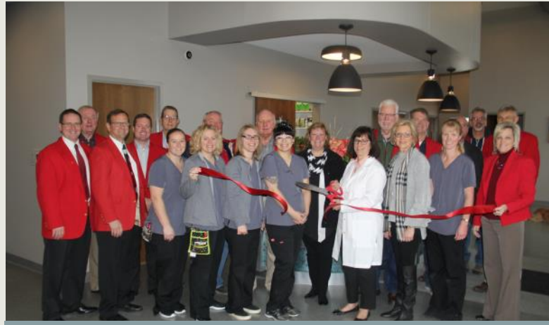
Boone Veterinary Hospital • December 4, 2018