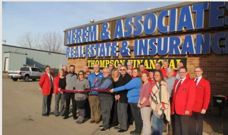
Nerem & Associates • December 11, 2018