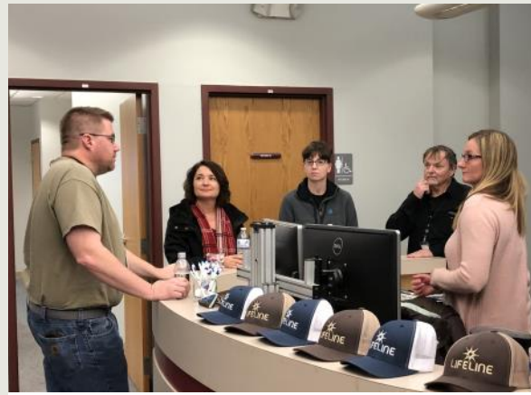
Business After Hours - APC