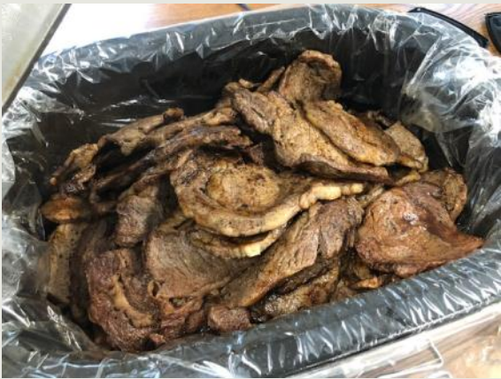
Member Appreciation June 18, 2019