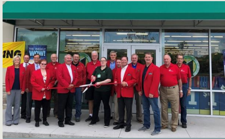
Dollar Tree • June 11, 2019