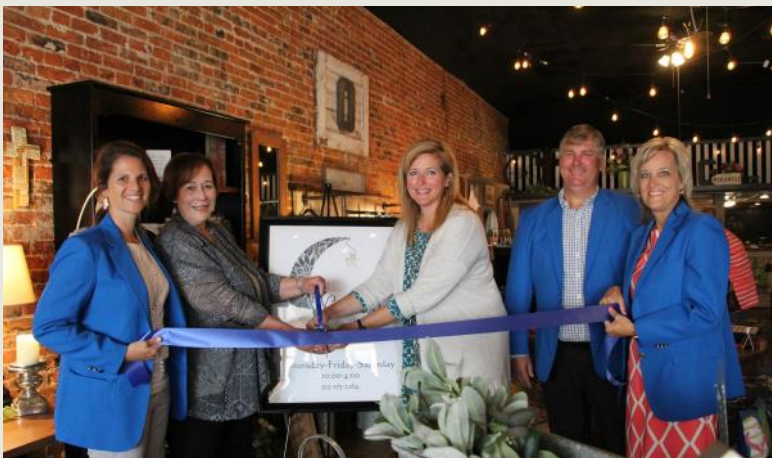
The New Moon Mercantile • June 20, 2019