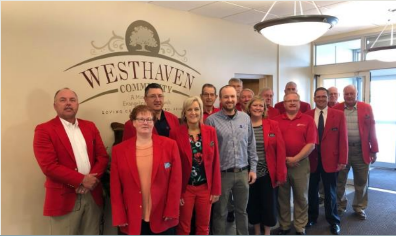
Westhaven Community • June 4, 2019