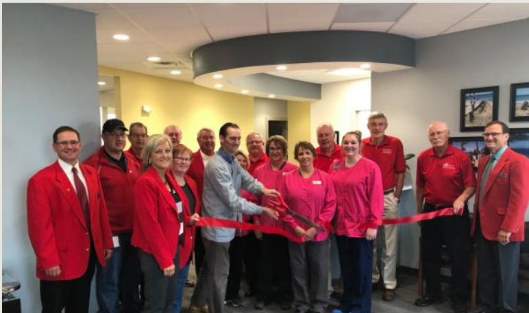
Boone Family Dentistry • June 18, 2019