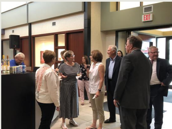
BAH- June 20th at VisionBank