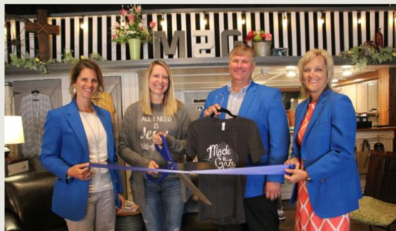
Made to Gaze • June 20, 2019