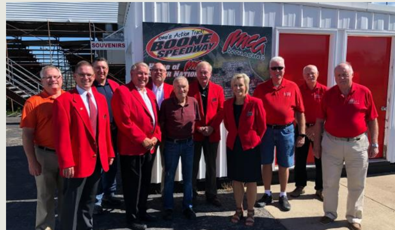
Boone Speedway • June 25, 2019