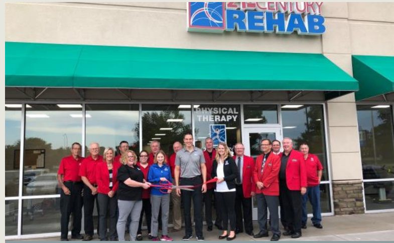
21st Century Rehab • September 10, 2019