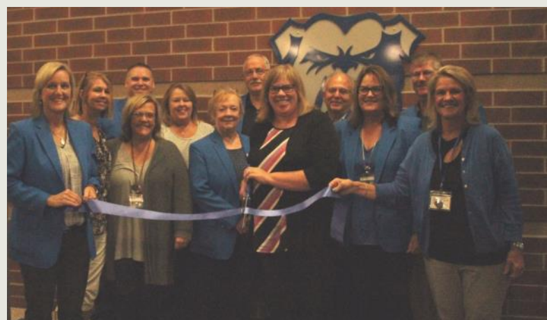
Ogden Elementary School • September 19, 2019