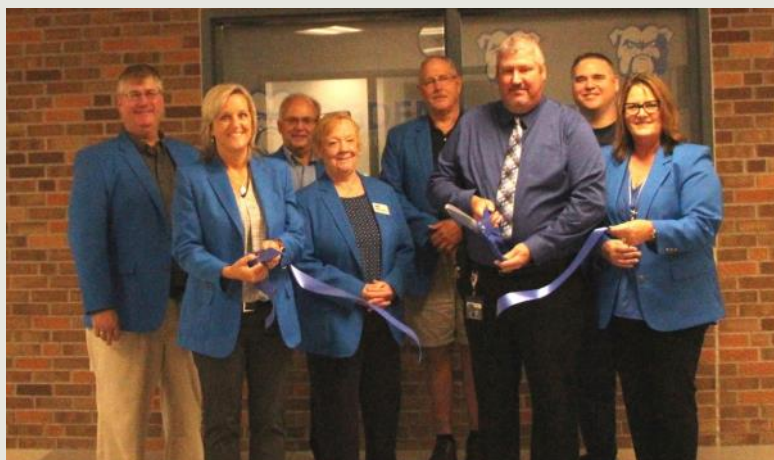
Ogden High School • September 19, 2019