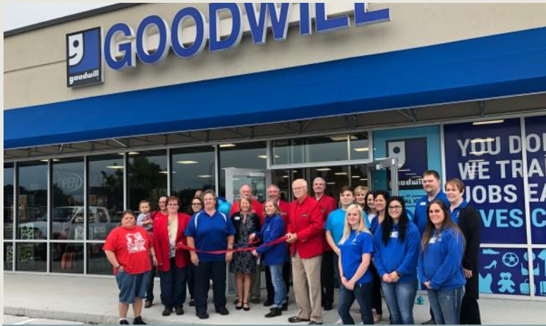
Goodwill of Central Iowa • September 27, 2019