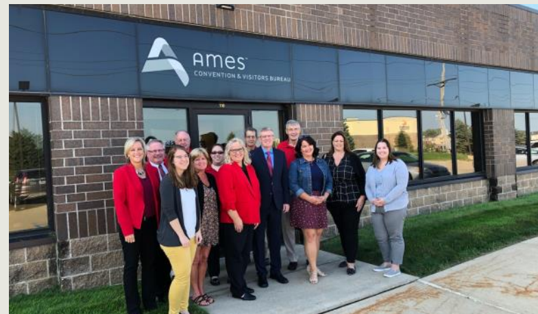
Ames CVB • September 24, 2019