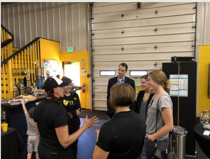
BAH – September 24 (Training For Warriors)