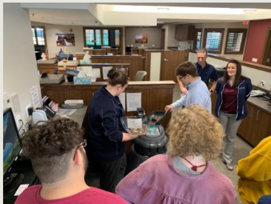
United Bank of Iowa