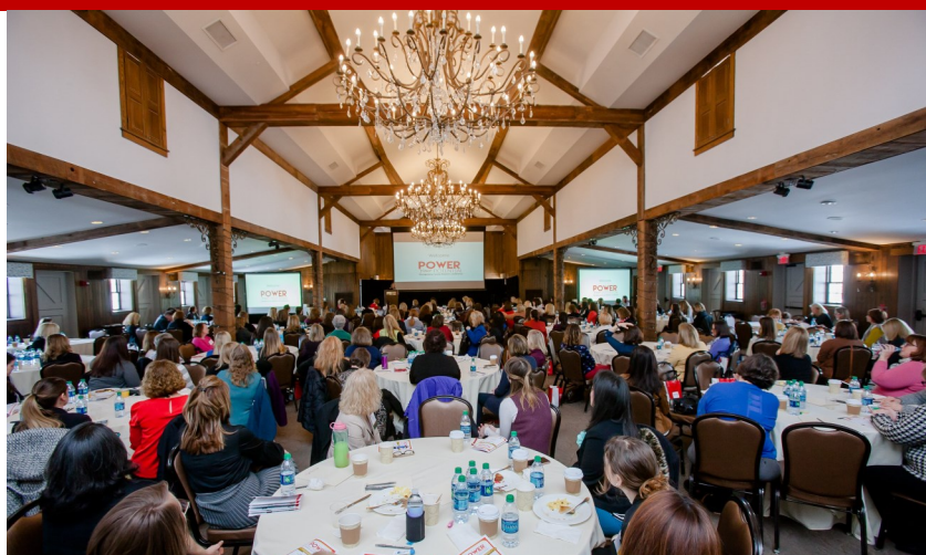
2018 Power Your Potential: Montgomery County Women's Conference

Merck & Co., Inc. , was the Presenting Sponsor for the third year, and was joined by thirty-one more sponsoring organizations.