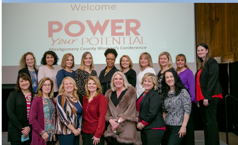
Guests from Presenting Sponsor, Merck & Co., Inc.