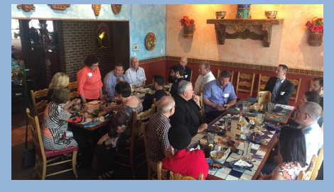
The Chamber celebrated Cinco De Mayo at our monthly NetNow at Margarita's Mexican Restaurant.