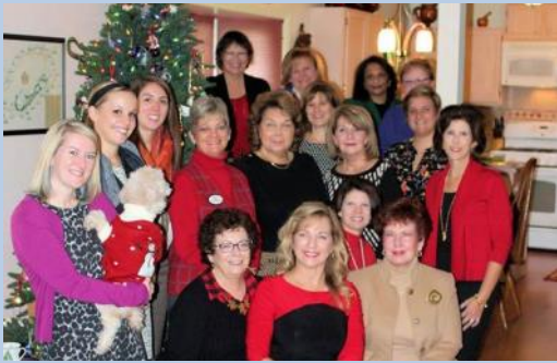
Women's Network Committee Appreciation