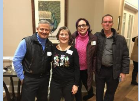
Women's Network holiday lunch & gift exchange at Normandy Farm