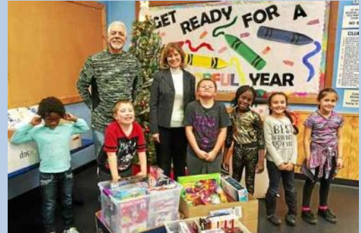
Chamber Members donated several boxes of toys to the North Penn Boys & Girls Club!