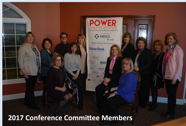
2017 Conference Committee Members