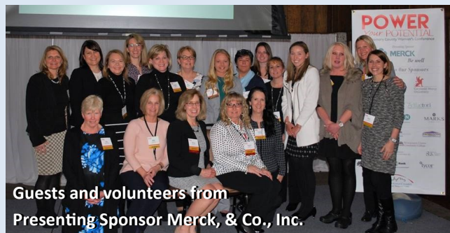
Guests and volunteers from Presenting Sponsor Merck, & Co., Inc.