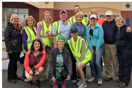
Chamber volunteers & staff.