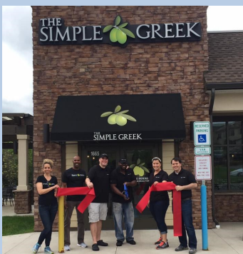
The Simple Greek is officially open in Dresher, marking their first corporate training/restaurant location.

Looking for referrals? The search stops here!