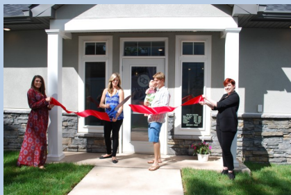
Congratulations to BA Salon on the grand opening of their newly built salon.