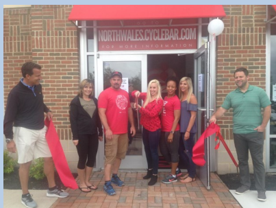
CycleBar in North Wales celebrated their grand opening and ribbon cutting with staff, friends and the Chamber.