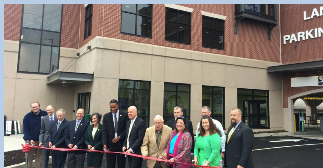
Lansdale Station garage was opened with local and County officials on hand.

Fortunoff Backyard Store opened with the help of PA State Rep.