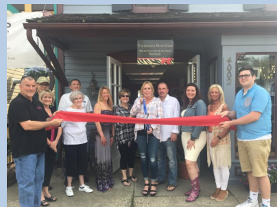
The Skippack Hope Chest celebrated their grand reopening.