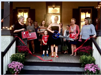
Ché Bella Designer Consignment Boutique opened its doors in Skippack with a ribbon cutting and celebration.