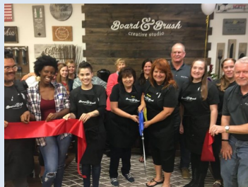
Board & Brush, a new DIY wood sign workshop in Blue Bell, recently held its grand opening.