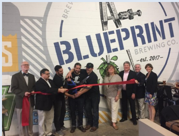
Blueprint Brewing Co. in Harleysville held a grand opening event for family and friends.