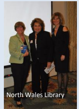
North Wales Library