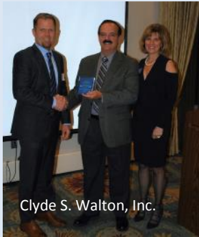
Clyde S. Walton, Inc.