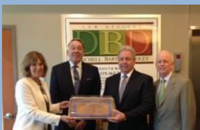
Thank you to the law firm of Dischell Bartle Dooley for 40 years of support.