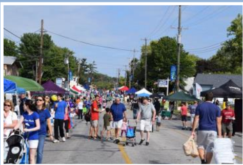
Lower Gwynedd Business Association Pike Fest 2016