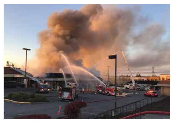
An early morning fire burns the Center Plaza Building in Federal Way. While the building of fire origin was destroyed, firefighters prevented the blaze from spreading and adjacent buildings and business were saved.

Both Federal Way and Des Moines have experienced a high rate of economic development and population growth and that growth has impacted fire district emergency response operations and resources. Data shows that over a 5-year period, calls for 911-emergencies have increased 24%. As a result, SKFR now responds to more than 20,000 calls per year and this number is expected to rise.